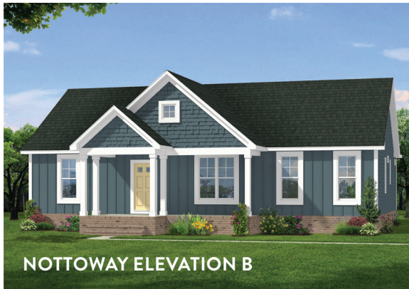
NOTTOWAY ELEVATION B