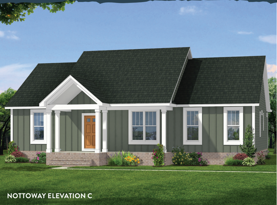
NOTTOWAY ELEVATION C