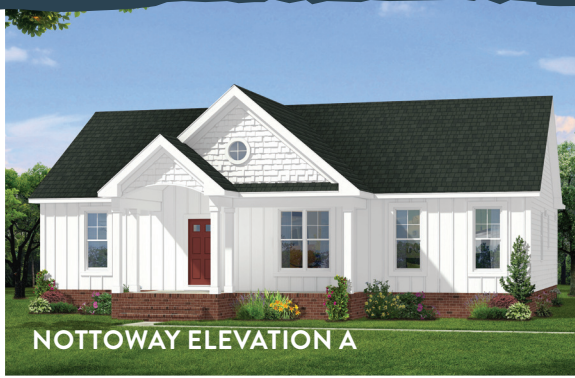
NOTTOWAY ELEVATION A