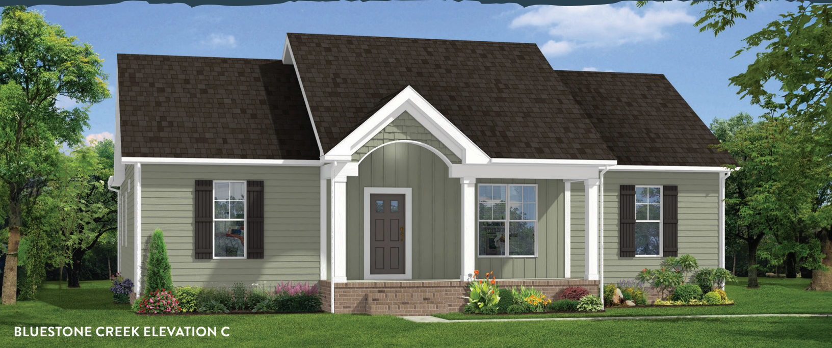
BLUESTONE CREEK ELEVATION C