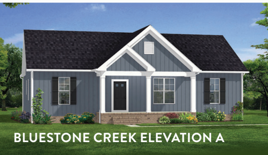
BLUESTONE CREEK ELEVATION A