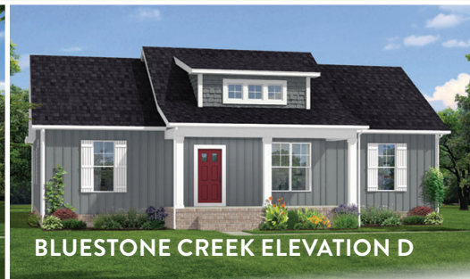
BLUESTONE CREEK ELEVATION D