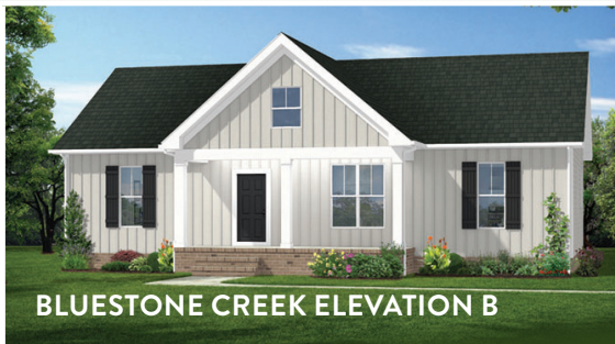
BLUESTONE CREEK ELEVATION B