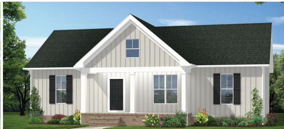
BLUESTONE CREEK ELEVATION B