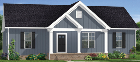
BLUESTONE CREEK ELEVATION A