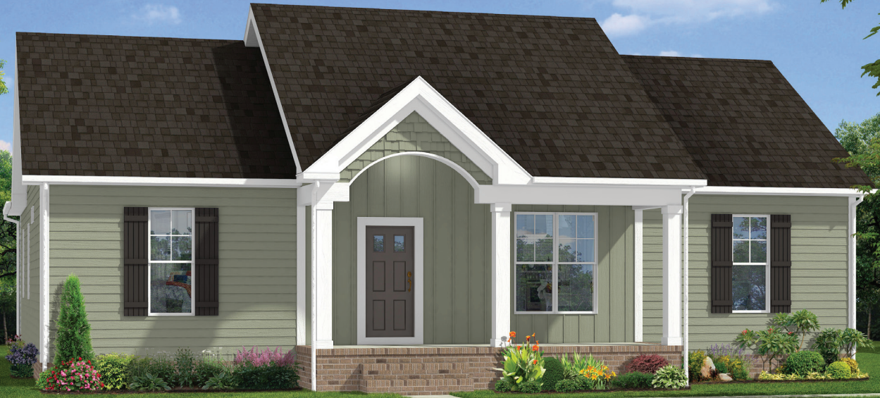
BLUESTONE CREEK ELEVATION C