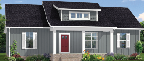
BLUESTONE CREEK ELEVATION D